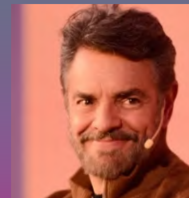
EUGENIO DERBEZ Actor, Dir., Prod. & Chairman & Co-Founder 3PAS Studios México